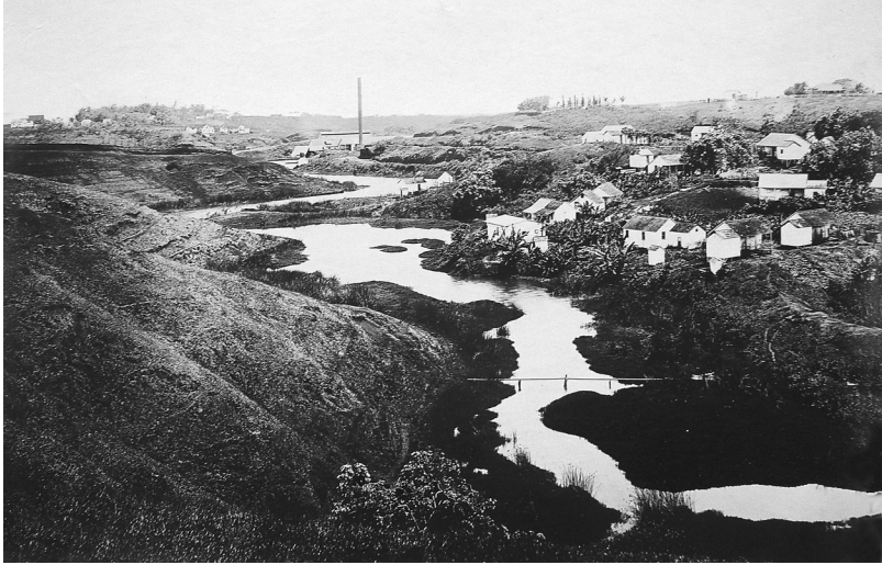
Nāwiliwili Stream forms the boundary between the Nāwiliwili and Kalapaki ahupua'a . The Lihue Plantation mill was erected in 1851 at the edge of the stream in Nāwiliwili ahupua'a ; the town grew up on the opposite side, in the ahupua'a of Kalapaki. Photo by J.J. Williams, 1887. Courtesy of Grove Farm Museum.

where it was located, “Lihue should have been Huleia but took [its] name from [the] mill site.” In other words, Wilcox suggested that the Lihue place name already existed along the Nāwiliwili stream in ancient Hulē‘ia at the boundary between the Nāwiliwili and Kalapaki ahupua'a , where Peirce & Company had constructed the original mill in 1851.