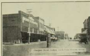
CHESTNUT STREET, LOOKING NORTH, HAYS, KANSAS.