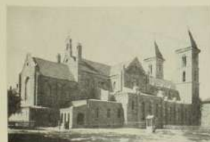
NORTHWEST VIEW OF ST. FIDELIS CHURCH, VICTORIA, KANSAS.