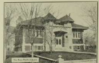
PUBLIC LIBRARY, HAYS, KANSAS.