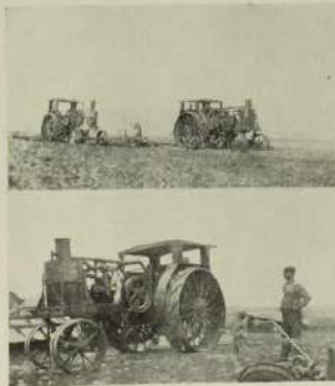
JOY BROTHERS, HAYS, KANSAS.

Lower View: "Final Inspection" before the next run Upper View: Modern plowing and discing; twenty plows and fifty-six discs. These trac- tors do the work of sixty-five horses.