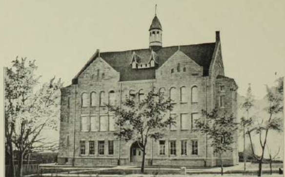
HAYS CATHOLIC COLLEGE, ESTABLISHED 1908, HAYS, KANSAS.

Lower View: "Final Inspection" before the next run Upper View: Modern plowing and discing; twenty plows and fifty-six discs. These trac- tors do the work of sixty-five horses.