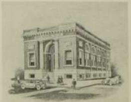
FIRST NATIONAL BANK, ELLIK, KANSAS.