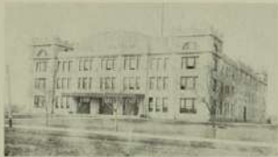
SHERIDAN COLISEUM, STATE NORMAL SCHOOL, HAYS, KANSAS.