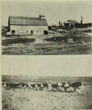
SCENES FROM THE ED. KRAUS RANCH. Upper picture shows house and barn, and lower pic- ture some of the prize winning white-faced cattle.