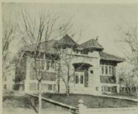
PUBLIC LIBRARY, HAYS, KANSAS.