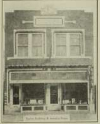
THOLEN'S STORE, EXTERIOR VIEW. HAYS, KANSAS.