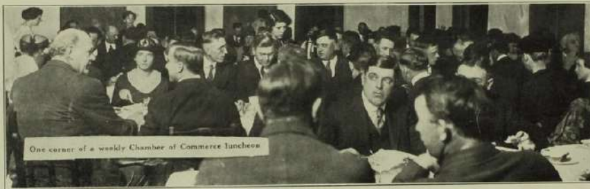
LUNCHEON AT THE CHAMBER OF COMMERCE, HAYS, KANSAS.