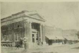
CITIZENS STATE BANK AND A VIEW ON NORTH CHESTNUT STREET, HAYS, KANSAS.