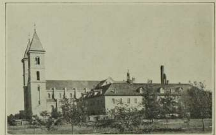
ST. FIDELIS MONASTERY AND CHURCH, VICTORIA, KANSAS.