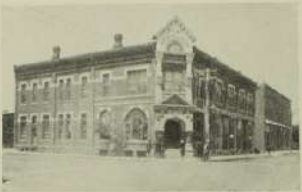
FIRST NATIONAL BANK, HAYS, KANSAS.