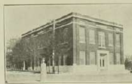
MUNICIPAL BUILDING, HAYS, KANSAS.