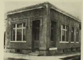
BANK OF HOLYROOD, HOLYROOD, KANSAS.