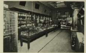
INTERIOR VIEW OF JEWELRY STORE OF FRED A. RESLER, ELLSWORTH, KANSAS.