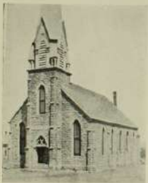
ST. PAUL'S EVANGELICAL LUTHERAN CHURCH, North-West of Ellsworth, Kansas.