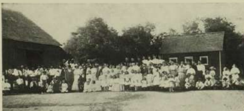
A WEDDING GROUP.