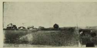
SCENE ON FARM OF JOSEPH VODRASKA, BLACK WOLF, KANSAS.