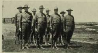
A SQUAD OF THE KANSAS STATE GUARDS, Photograph from the Bank of Holyrood, HOLYROOD, KANSAS.