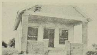
FARMER'S STATE BANK, VARNER, KANSAS.