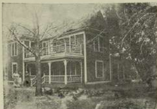
FOREST VIEW STOCK FARM, W. S. De Weese, Proprietor, NASHVILLE, KANSAS.