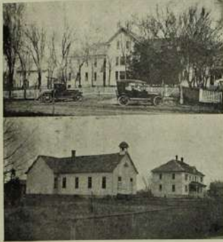
BETHESDA HOSPITAL, AND GOESSEL PREPARATORY SCHOOL AND BOARDING HALL, GOESSEL, KANSAS.