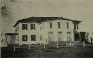
ALEXANDERWOHL CHURCH, CANTON, KANSAS.