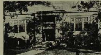
PEABODY PUBLIC LIBRARY, PEABODY, KANSAS.