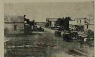
MAIN STREET, WEST SIDE, LINCOLNVILLE, KANSAS.