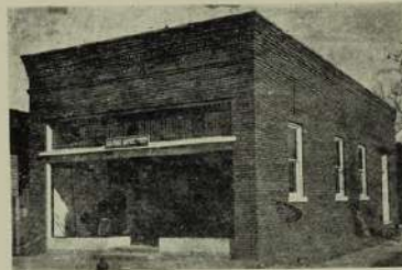
POST OFFICE, FLORENCE, KANSAS.