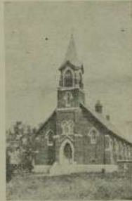
ST. JOHN'S NEPT CHURCH, PILSEN, KANSAS. This is the Largest Church in Mar- tion County, Kansas. It was Built in the Year 1914, and can be seen for many miles.