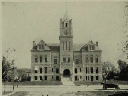
MARION COUNTY COURT HOUSE, MARION, KANSAS.