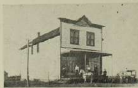
POST OFFICE, PILSEN, KANSAS.