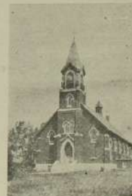
PILSEN CHURCH, PILSEN, KANSAS.