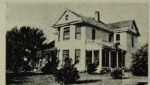
RESIDENCE ON THE MCCLAIN FARM