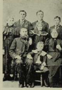
FAMILY GROUP