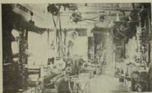
INTERIOR VIEW OF HENRY LUNG- STROM'S MACHINE SHOP, LINDSBORG, KANSAS.