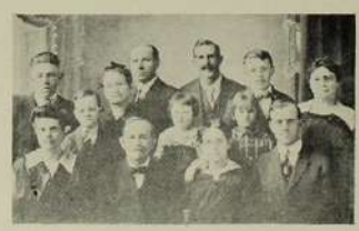
FAMILY GROUP