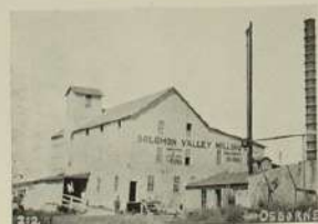
SOLOMON VALLEY MILLING CO., OSBORNE, KANSAS.