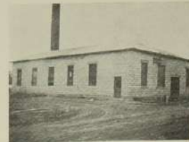
SOLOMON VALLEY POWER CO. PLANT, DOWNS, KANSAS.