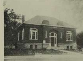
PUBLIC LIBRARY, DOWNS, KANSAS.