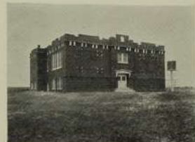
COVERT RURAL HIGH SCHOOL, COVERT, KANSAS.