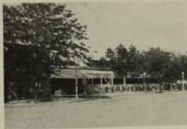
THE HARDMAN LUMBER CO., OSBORNE, KANSAS.