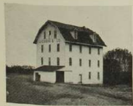
DOWNS MILLS—JACKSON & CO., DOWNS, KANSAS.