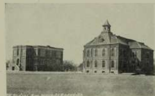
SCHOOL BUILDINGS, OSBORNE, KANSAS.