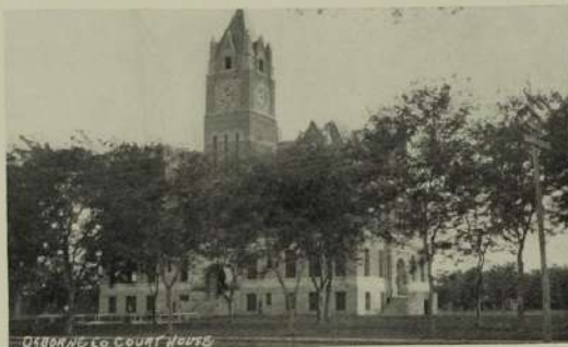
OSBORNE COUNTY COURT HOUSE, OSBORNE, KANSAS.