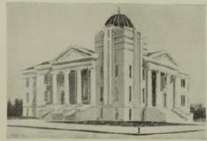
M. E. CHURCH, DOWNS, KANSAS.