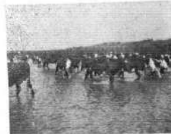
Herd of Cattle, HOAGLAND BROS.