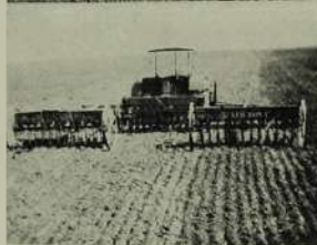
Up-to-the-Minute Farming Methods on the Farm of J. J. Brehm, R. F. D. No. 1, Pratt, Kansas. Upper picture shows har- vesting and threshing wheat at one oper- ation. Lower picture, drilling 80 acres in one day.