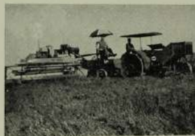
Up-to-the-Minute Farming Methods on the Farm of J. J. Brehm, R. F. D. No. 1, Pratt, Kansas. Upper picture shows har- vesting and threshing wheat at one oper- ation. Lower picture, drilling 80 acres in one day.