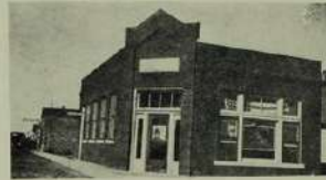
FARMERS STATE BANK, HOPEWELL, KANSAS.