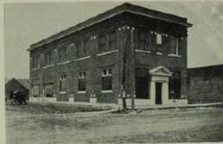
COATS STATE BANK, COATS, KANSAS.