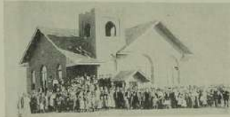
RURAL FRIENDS CHURCH, Section 30, Township 26, R. 14, Pratt County