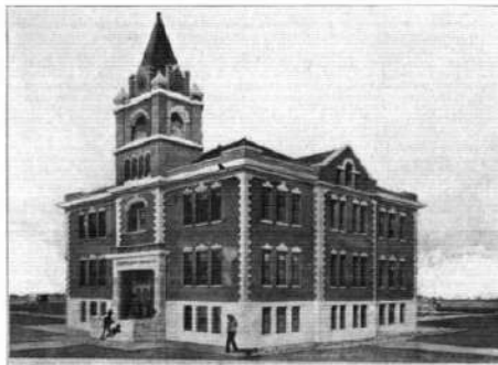
RAWLINS COUNTY COURT HOUSE