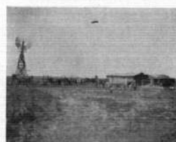
AUDLET NISSEN, FAIR SCRIBE.