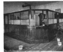
MENLO STATE BANK