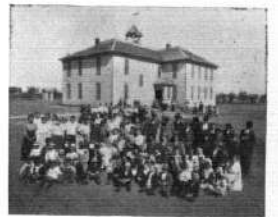
CITY AND COUNTY HIGH SCHOOL.