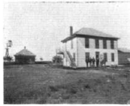
SHERIDAN COUNTY COURT HOUSE