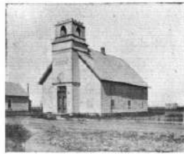
PRESBYTERIAN CHURCH, HOXIE, KANSAS.