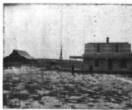
RANCH VIEW, F. SIEMENS.