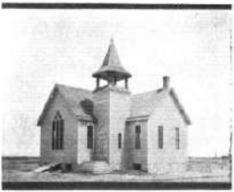
FIRST M. E. CHURCH, HOXIE, KAN.