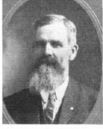
W. H. SMITH