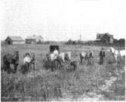
SCENE ON RANCH OF C. C. TURNER