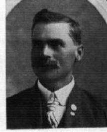
D. K. COUNCIL.