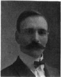
C. S. EENBAU.