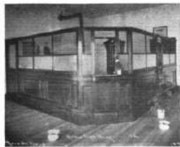
MENLO STATE BANK