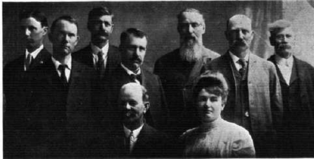
THOMAS COUNTY OFFICIALS.