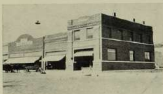
THE ESKRIDGE STATE BANK, ESKRIDGE, KANSAS.