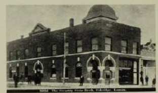
THE SECURITY STATE BANK, ESKRIDGE, KANSAS.