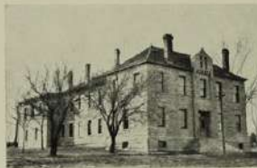
WABAUNSEE COUNTY COURT HOUSE, ALMA, KANSAS.