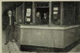
INTERIOR VIEW OF BANK OF ALMA, ALMA, KANSAS.