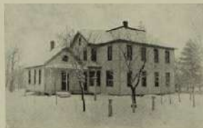
THE MIDLAND TRAIL FARM IN KAW TOWNSHIP, Photograph from Herman Uhrig, WAMEGO, KANSAS.