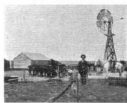
SCENE ON RANCH OF NEILS SWANSON.