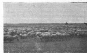
SOME FINE STOCK OF JAS. VOXALL.