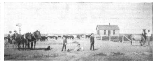
SCENE ON RANCH OF GUST BJORKLUND.