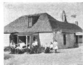
RESIDENCE OF PHIL TRED.