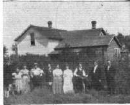
VIEW FROM PHOTO SENT BY J. M. HRALEY