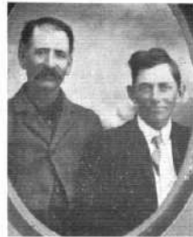
R. G. WATT AND SON ED.