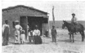
VIEW FROM PHOTO SENT BY B. F. ONBY.