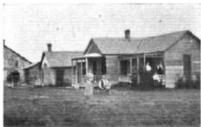
RESIDENCE OF PETR ROBIDOUX