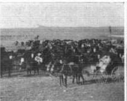
SOME FINE STOCK OF PETE ROBIDOUX.