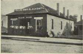
BLACKSMITH SHOP OF OLLIE SIMS, FULTON, MO.