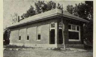
FARMERS BANK, STEPHENS, MO.