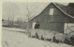
SOME FINE SHEEP ON THE 250 ACRE FARM OWNED BY J. P. DEARDORFF. This farm is covered with blue grass and Walnut Timber. BACHELOR, MO.