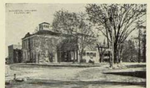
SYNOICAL COLLEGE, FULTON, MO.