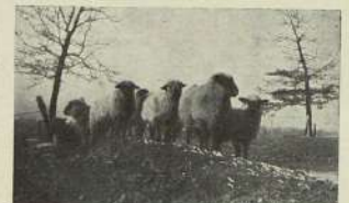
PHOTOGRAPH TAKEN ON FARM OF A. E. KEMPER, FULTON, MO.