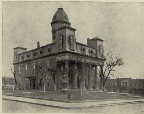
CALLAWAY COUNTY COURT HOUSE, FULTON, MISSOURI.