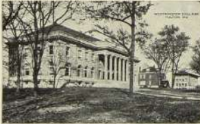
WESTMINSTER COLLEGE, FULTON, MO.