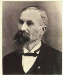
H.E. POND NOVELTY