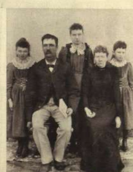
B. F. HOLMAN & SON LACROFT HILL