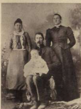
W. JACOB & SON KNOX CITY