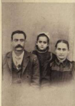
W. W. KERRICK & SON NOVELTY