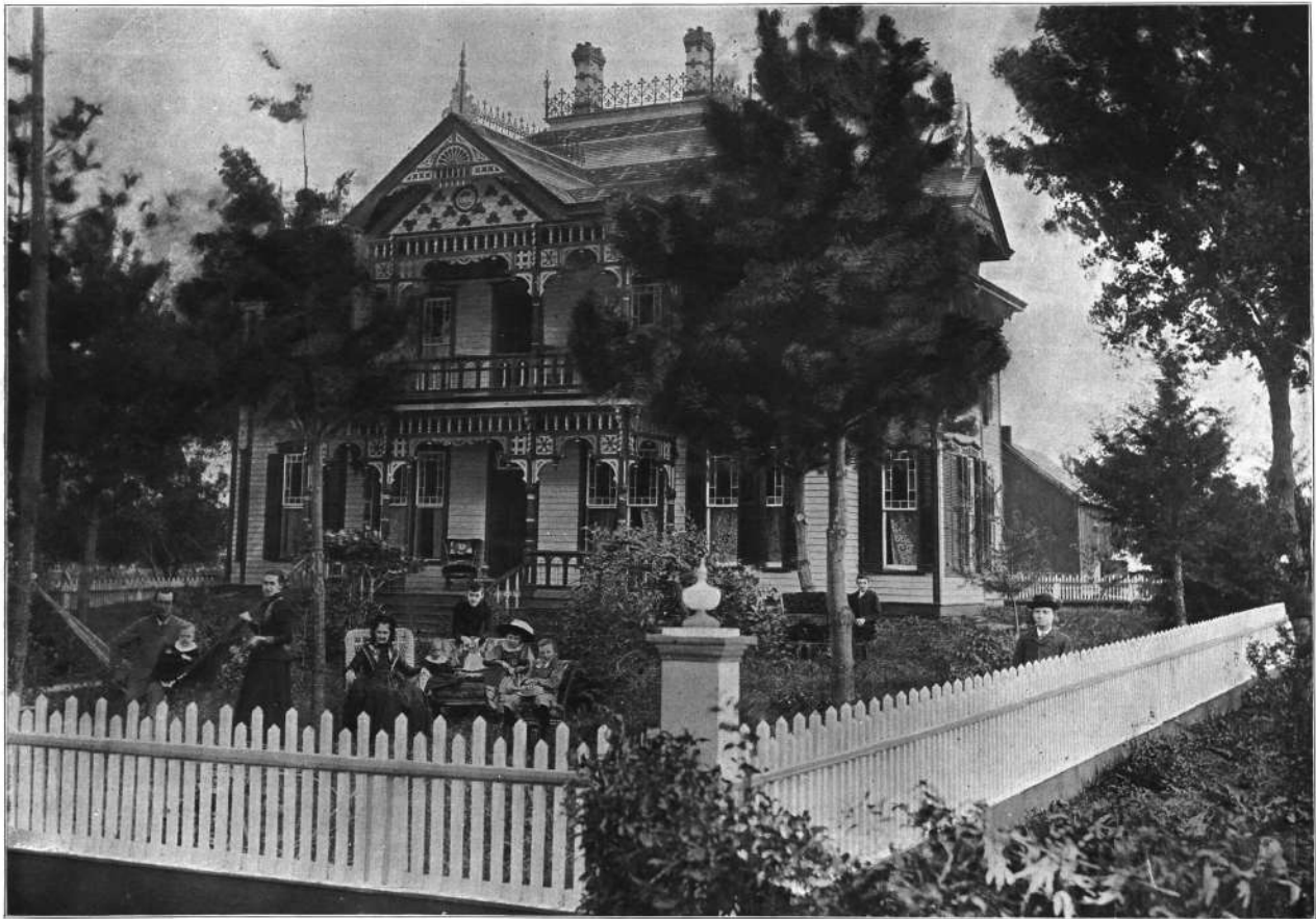
RESIDENCE OF A. E. BLACK, NEAR HURLAND, MO.

9. GLENN BLACK, Born September 13, 1888. 10. LESLEY BLACK, Born March 18, 1897.