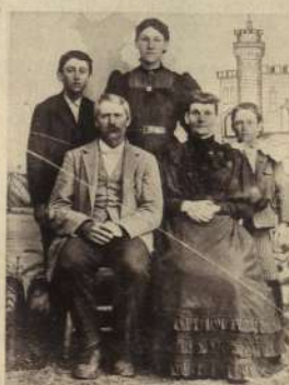
L. F. RICHARDS & SON NOVELTY