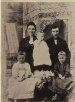
E. L. LAKE & SON EDINA