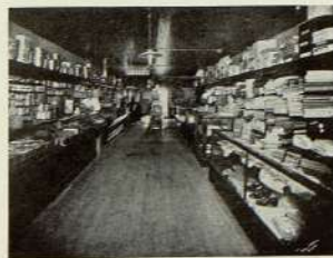
INTERIOR VIEW STORE OF C. H. BROSIUS.