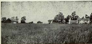
CEDAR CREST FARM, Grove Bros. Proprietors, BARKING, MO.