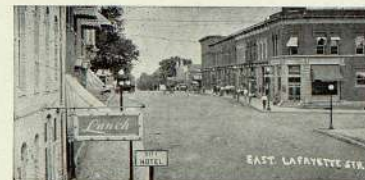
EAST LAFAYETTE STREET, EDINA, MO.