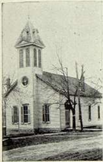
PRESBYTERIAN CHURCH, EDINA, MO.