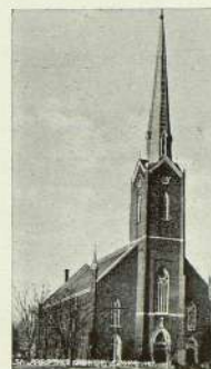
ST. JOSEPH'S CATHOLIC CHURCH, EDINA, MO.