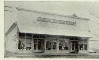
WHITBREAD AND MOORE, NEWARK, MO.