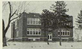
PUBLIC SCHOOL, EDINA, MO.