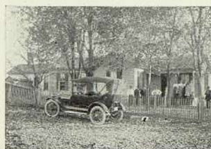
RESIDENCE OF SHUMATE BROTHERS, EDINA, MO.