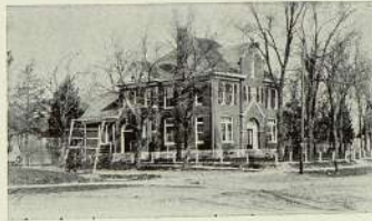
CONVENT, EDINA, MO.