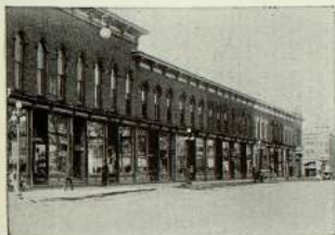
STREET SCENE IN EDINA, MO.