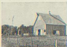
BARN OF WORTH PENDERLY, NOVELTY, MO.