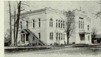
ST. JOSEPH'S CATHOLIC SCHOOL, EDINA, MO.