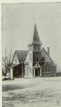
M. E. CHURCH, EDINA, MO.