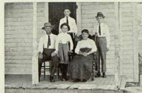
FAMILY GROUP