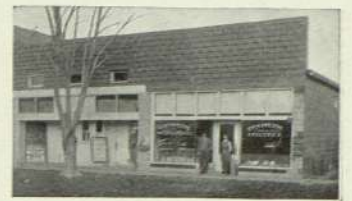
HUNTER BUILDINGS, NOVELTY, MO.