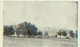
PRAIRIE VIEW FARM, C. B. Kreigshauser, Proprietor, EDINA, MO.