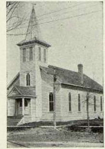
M. E. CHURCH, SOUTH, EDINA, MO.