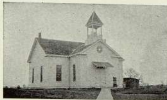
PUBLIC SCHOOL, NEWARK, MO.