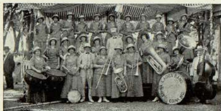
LADIES BAND OF EDINA, MO.