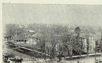
BIRDS-EYE VIEW OF EDINA, MO.