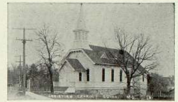
CHRISTIAN CHURCH, EDINA, MO.