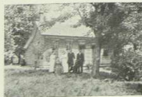
FERDINAND CLOTE AND FAMILY