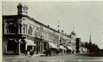
WEST SIDE SQUARE, EDINA, MO.