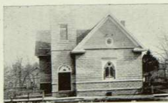
BAPTIST CHURCH, EDINA, MO.