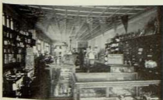
INTERIOR VIEW OF HARDWARE STORE OF HARDY BROS., NOVELTY, MO.