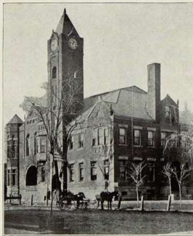
COURT HOUSE, LANCASTER, MO.