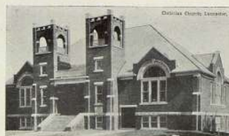
CHRISTIAN CHURCH, LANCASTER, MO.