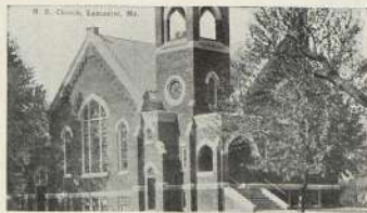
M. E. CHURCH, LANCASTER, MO.