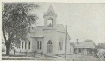
BAPTIST CHURCH, LANCASTER, MO.