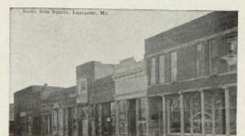
SOUTH SIDE SQUARE, LANCASTER, MO.