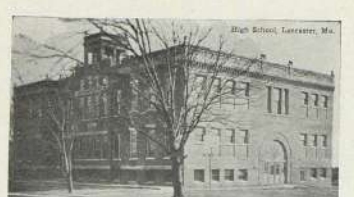
HIGH SCHOOL, LANCASTER, MO.