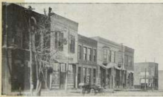
WEST SIDE OF SQUARE, LANCASTER, MO.