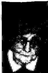
FERN JENNEW EIN