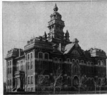
CLOUD COUNTY COURT HOUSE