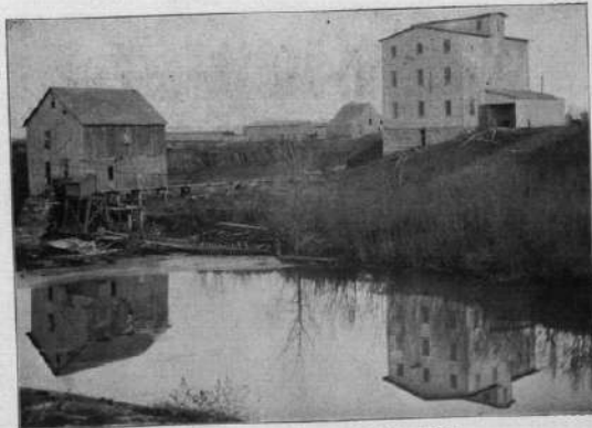
SIMPSON ROLLER MILLS Long Bros., Props.