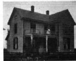
ST. ANTHONY'S RECTORY, ST. PETER, KANSAS.