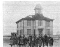
DOBGE SCHOOL HOUSE.