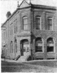
CITIZENS STATE BANK Jettmore, Kansas