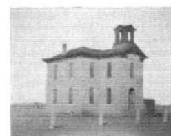
SCHOOL HOUSE, JETMORE, KANSAS