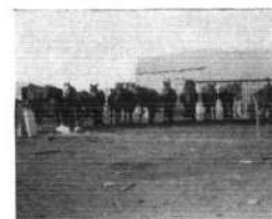
STOCK OF EDW. MILLER