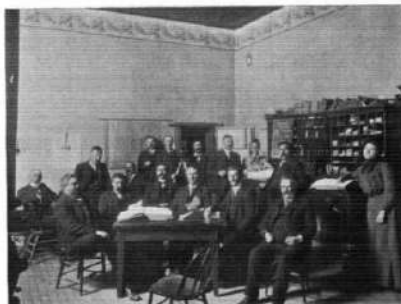
KIOWA COUNTY OFFICIALS.