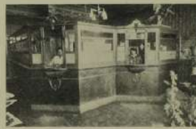
INTERIOR VIEW OF BEVERLY STATE BANK, BEVERLY, KANSAS.