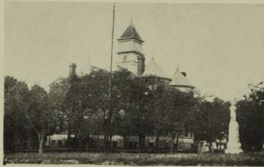
LINCOLN COUNTY COURT HOUSE, LINCOLN, KANSAS.