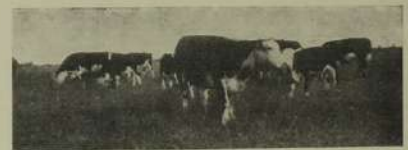
PRIZE WINNING COW AND PART OF PURE BREED HEREFORD HERD, Belonging to Kohler & Greene, BEVERLY, KANSAS.