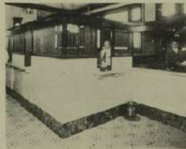
INTERIOR VIEW OF SYLVAN STATE BANK, SYLVAN GROVE, KANSAS.