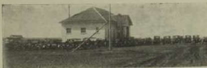
THE LAST DAY AT SCHOOL AT DISTRICT NO. 5, PLEASANT VALLEY, Photograph from Albert Hundertmark, LINCOLN, KANSAS.