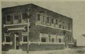
SYLVAN STATE BANK, SYLVAN GROVE, KANSAS.