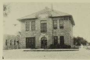
CITY HALL, LINCOLN, KANSAS.