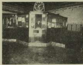
INTERIOR VIEW OF UNION STATE BANK, BEVERLY, KANSAS.