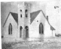
CHRISTIAN CHURCH, RANSOM, KAN- SAS