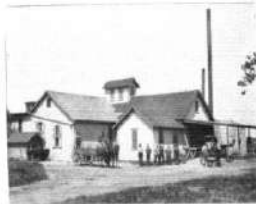
THE MERRITT LUMBER CO., GREAT BEND, KANSAS