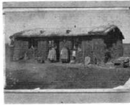
SAW HOUSE OF TILLMAN PETERS BUILT 1884