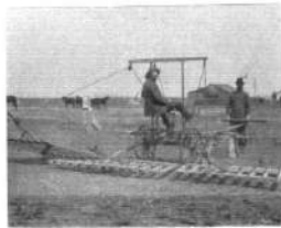
FARM SCENE MOSES LANGELLER