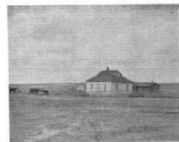
RESIDENCE OF PHILP TRUMP