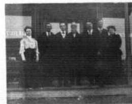
OFFICERS AND DIRECTORS THE FIRST STATE BANK, RANSOM, KANSAS