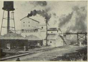
VIEW OF THE A. P. GREEN FIRE BRICK CO., Of Mexico, Mo., Located on the Wabash and C. & A. Railroads.