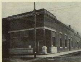
WELLSVILLE BANK, WELLSVILLE, MO.