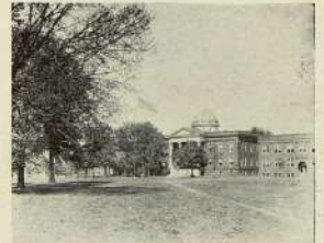
MISSOURI MILITARY ACADEMY, MEXICO, MO.