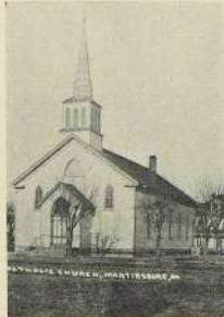
CATHOLIC CHURCH, MARTINSBURG, MO.