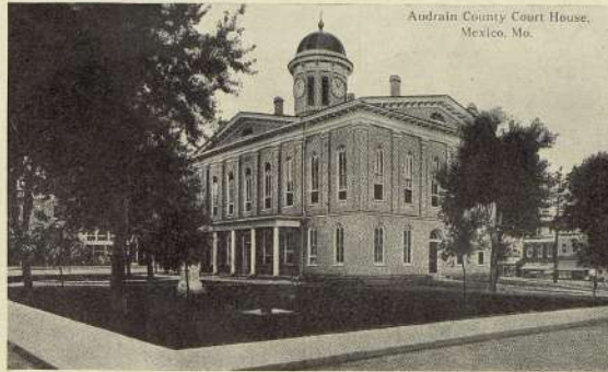
AUDRAIN COUNTY COURT HOUSE, MEXICO, MISSOURI.