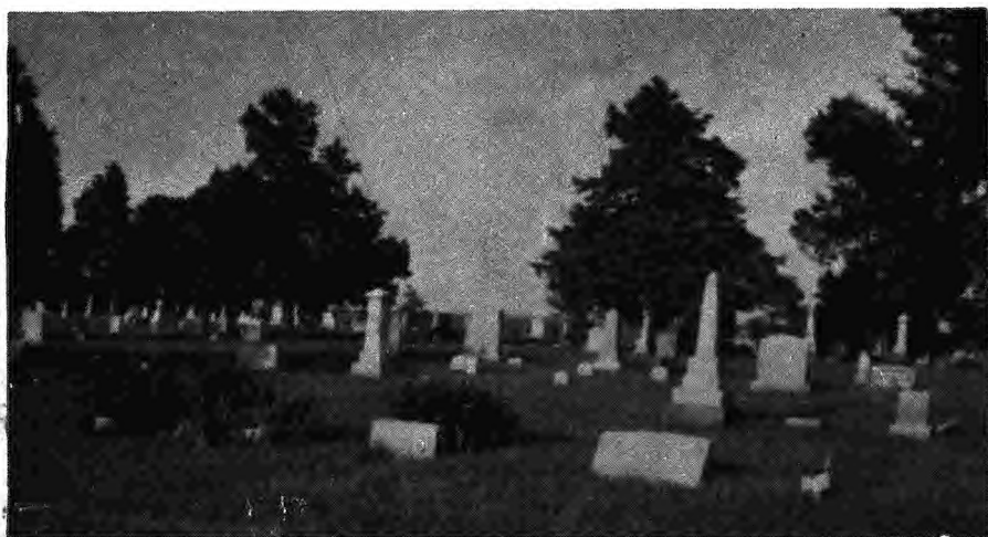
View of Austin Cemetery.