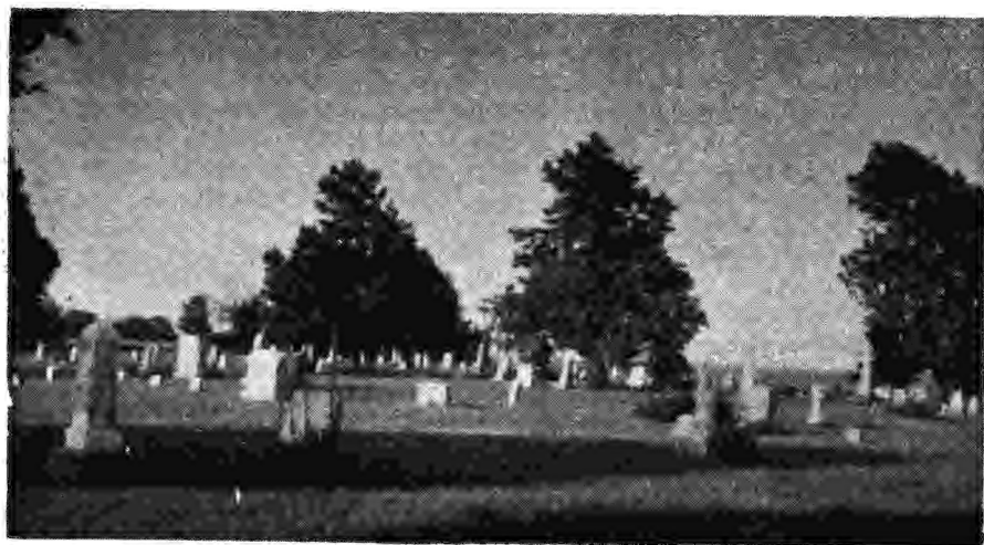
View of Austin Cemtery.