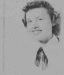
Martha Hill 3 & 4 Grades