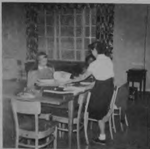
Girls who take Cooking