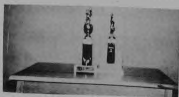
TROPHIES WON IN 1953 BY B.B. GIRLS