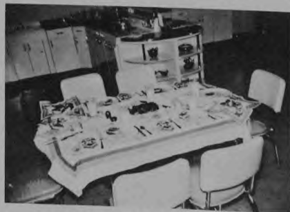
Luncheon prepared by the Cooking class