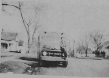
Clay Trussel Bus Driver