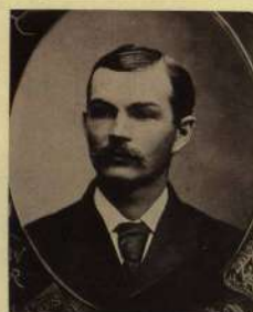
S. W. ANDERSON, JR. MILK