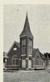
PRESBYTERIAN CHURCH, CHILLICOTHE, MO.