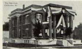
THE ELKS CLUB, CHILlicothe, MO.