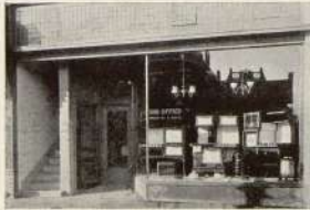
PEOPLE'S GAS AND ELECTRIC CO., 712 Locust St., CHILICOTHE, MO.