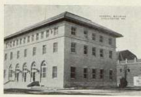
FEDERAL BUILDING, CHILLICOTHE, MO.