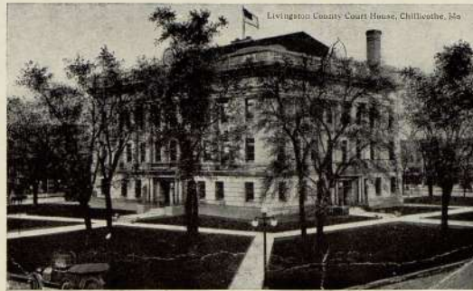
LIVINGSTON COUNTY COURT HOUSE, CHILlicothe, MISSOURI.