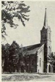
ST. COLUMBAN'S CHURCH, CHILLICOTHE, MO.