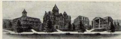
CHILICOTHE BUSINESS COLLEGE, CHILICOTHE, MO.