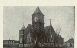
BAPTIST CHURCH, CHILLICOTHE, MO.