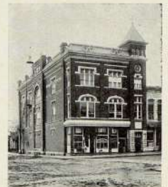
MASONIC TEMPLE BUILDING, CHILLICOTHE, MO.