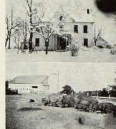
RESIDENCE AND SCENE ON FARM OF JONES BROS., CHILICOTHE, MO.