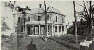
RESIDENCE OF ROCKHOLD BROTHERS, UTICA, MO.