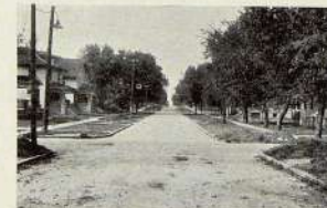
EAST CLAY STREET, CHILlicothe, MO. Paved with "Tarvis" in 1915.