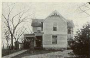
PIPER-SPRING VALLEY STOCK FARM, On Ben-Hur Highway, 7 Miles North-West of Chillicothe, Mo.