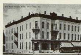
THE NEW LEEPER HOTEL, CHILLICOTHE, MO.