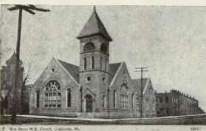
ELM STREET M. E. CHURCH, CHILLICOTHE, MO.