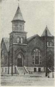
FIRST M. E. CHURCH, CHILLICOTHE, MO.