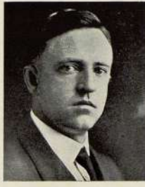
MILES ELLIOTT, Probate Judge, CHILlicothe, MO.