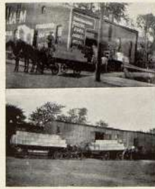
LOADING EGGS, Photographs from Henderson & Sons Produce Co., CHILICOTHE, MO.