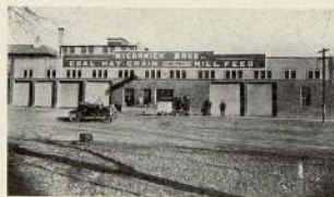
MCCORMICK BROS., PRESSED BRICK, COAL AND FEED BUILDING, One of the largest in North Missouri, 421-31 Washington Street, CHILICOTHE, MO.