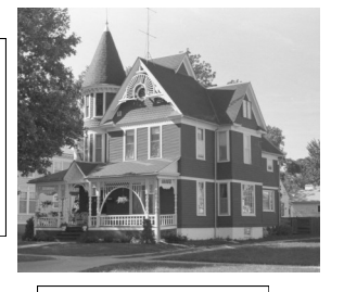
110 S. 12th St.