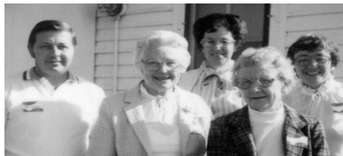
Teachers at the 1982 Reunion