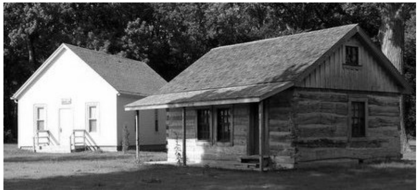
After the school was closed in 2006, it was moved to Verges Park at the Elkhorn Valley Museum along with the Dederman Cabin which was moved previously and restored.